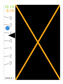
Figure 3: Artificial horizon Page (locked)